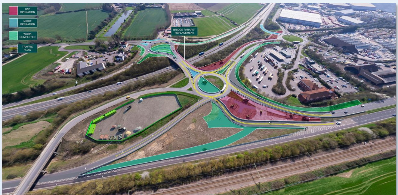
Diagram of works to be undertaken at Boreham Interchange between June and July 2021

More details about the Boreham Interchange Works are available on the following website: https://www.essexhighways.org/highway-schemes-and-developments/highway-schemes/boreham-capacity-improvements.aspx