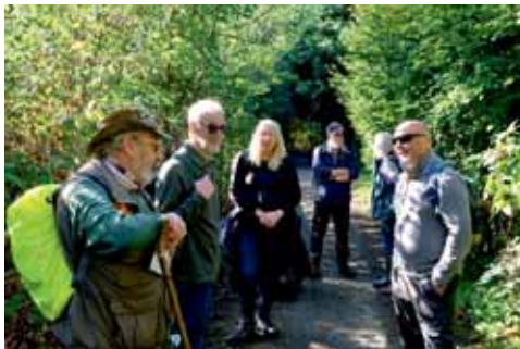
(October's Walking Group en route to Gosbecks)

TO ALL PATIENTS OF THE LITTLE WALTHAM AND GREAT NOTLEY SURGERIES YOU ARE WELCOME TO COME TO THE PATIENT PARTICIPATION GROUP'S OPEN MEETING ON WEDNESDAY 25 th JANUARY 2023 AT 7.00 PM AT GREAT NOTLEY SURGERY