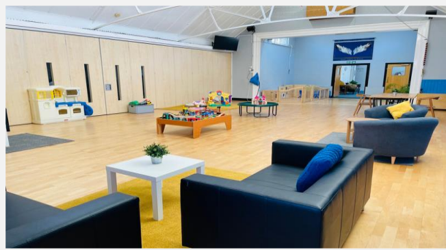
St Michaels Church, Loughton