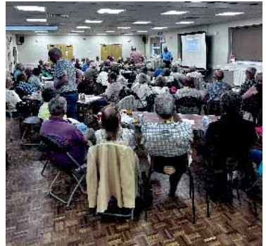
At the monthly meeting

What's currently available at the branch? Well, if you like the idea of stretching your legs and exploring the Essex countryside, there are regular guided-walks, finished off with a tasty pub lunch! Not too keen on walking? There's a 'bus-pass' group making visits to places of interest across the county via public transport. If you're interested in topics such as, natural history, geology, photography, table tennis, scrabble, ukelele, to name just a few, there are opportunities to take part in volunteer-led special interest groups covering all those. To find out more about those groups and all the others currently on offer, just google-search our website, 'Broomfield & District u3a' where you can also take a look at our regular newsletters, get contact details and obtain application forms. Along with the interest groups, we hold monthly meetings at Broomfield Village Hall (second Wednesday of the month 1.30-4.00pm) which provide an opportunity for members to come together to share information, socialise, and enjoy presentations by invited guest speakers on a very wide range of topics.