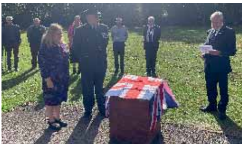
RBL give background info of project to assembled guests

On Thursday 5th October 2023 a celebration took place in the gardens of Broomfield Hospital to officially unveil a memorial plaque to commemorate Broomfield Airfield. The airfield was home to the No.37 Home Defence Squadron for a short time during World War I, before being used by the Chelmsford and District Flying Club until 1932,