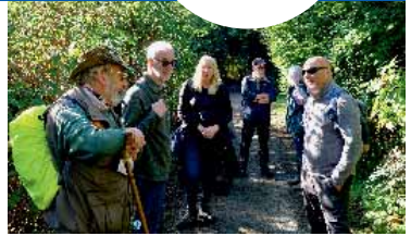
Walkers take a break

u3a is for people who are no longer working and who want to keep mind and/or body active in a friendly, sociable company. We are your local branch and are a charity, part of a national network, run entirely by volunteer members.