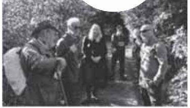
The walking group on a monthly walk. We usually have good weather and always start and finish at a pub with good food! Check out our other groups via the Broomfield and District u3a website.

If you've never heard of u3a, it is a national collection of charities run by and for members which was established to promote opportunities for those no longer in work to come together and learn for fun. Our local u3a offers opportunities to participate in range of member-led social, recreational and learning activities and interest groups, and if you have particular skills, knowledge or enthusiasms you'd like to share, there's scope to add these to the local 'offer'.